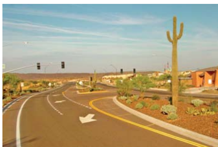
El Mirage Road