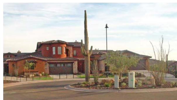
Blackstone Parcel B3 - 64 Duplex/Triplex Lots, Peoria