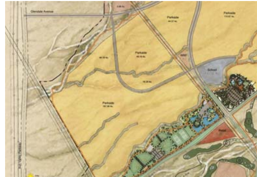
Anthem Sun Valley Phase I – Conventional Community 380 Acres, 965 Lots, Buckeye