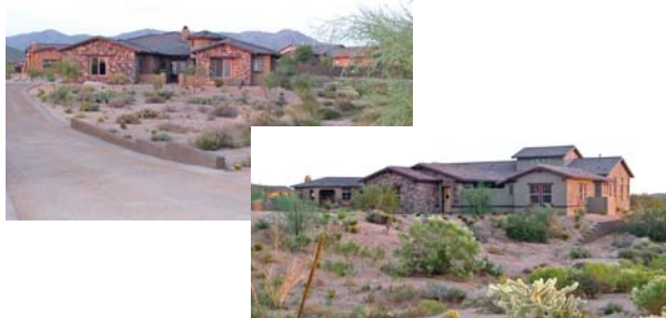
Bel Canto – 16 Custom Lots, Grading and Drainage Plans, Scottsdale