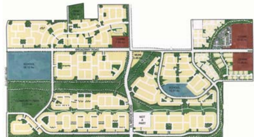
Lakin Ranch Master Planned Community – 1,100 Acres, 2,700 lots, Avondale