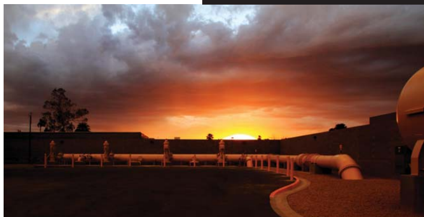
Camelback Core Booster Pump Station